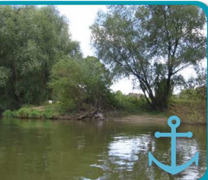
5. Coast nearby „Pod Kasztanami” Inn

mute swan are the most dominant. Some of the species have liked the city so much that they spend winter on the Oder River, its tributaries and ponds.