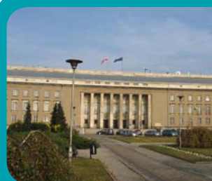
30. Governor's Office