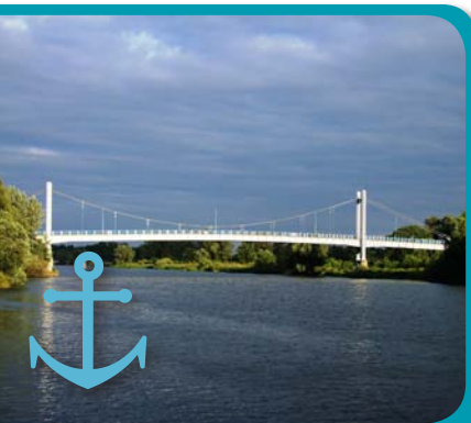
2. The Zwierzyniecka Footbridge

6 The Opatowice Lock: One of the most beautiful locks on the Oder River. It is 75 meters long, 10 meters wide and with a slope of 2.5 meters. It is often visited by Wrocław's inhabitants, mainly by cyclists. The way to the Rakowiec estate leads through Międzyrzecka and Opatowicka streets.