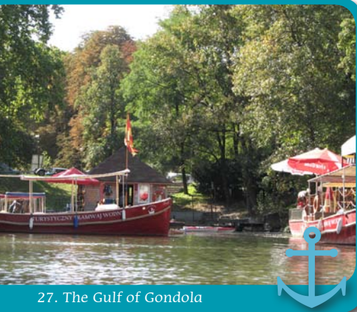
27. The Gulf of Gondola

⌚ - Here we turn back and, keeping to the right, we pass the marina Kardynalska on the Sand Island (one of four city islands besides Bielarska, Słodowa and Tamka islands), and the marinas Golden Duck and Targowa on the Dunikowski boulevard.