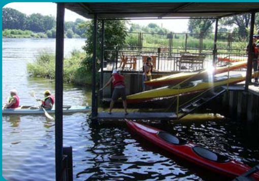
WODNIK Hotel marina

The start and the end of the canoe trail