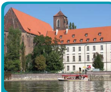
24. Marina „Kardynalska”