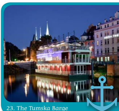
23. The Tumska Barge

23 The Tumski Barge and city islands: After crossing the Tumski Bridge, and before arriving at the Klara culvert, we can see the newest Oder River attraction floating on the water. It is the three-storey barge, the restaurant in the vicinity of the hotel. It caters to 220 people on three decks.