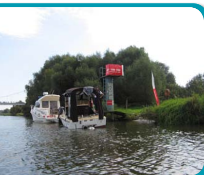
1. The WOPR marina

8.6 km - As we pass the Polish Tourist Association WIADRUS (we can go out and visit the ZOO and the surroundings of the Szczytnicki Park) and the villa of the University of Physical Education (AWF), we sail to the Oder Navigation Harbour, next to the new entrance to the ZOO: the Japanese Gate. There is a summer café situated next to the Szczytniki Weir and the Szczytniki Lock complex, both renovated with great care after the flood of 1997.