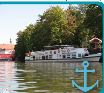
26. The Trade Harbour

At its very top there is the observation deck, open only during the summer. Views over the beautiful Ostrów Tumski monuments and city islands (Piasek, Słodowa, Bielarka, Tamka) stretch beyond the deck.