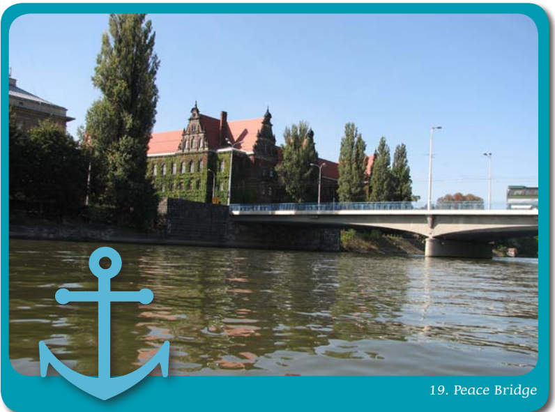
19. Peace Bridge