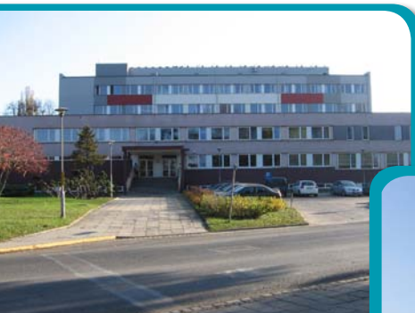
34. PAN Low Temperatures Institute