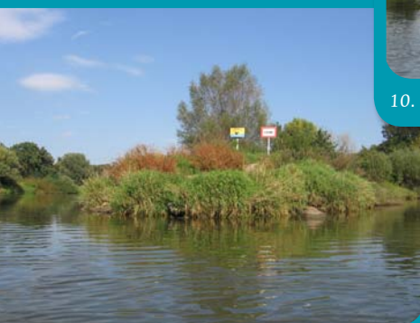
The Opatowicka Island