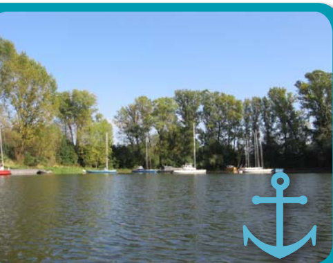
11. The Scout Water Resort STANICA

13a The Centennial Hall (People's Hall): This outstanding achievement of modern architecture was the largest building in the world in 1913 made of reinforced concrete. This building is listed on a UNESCO