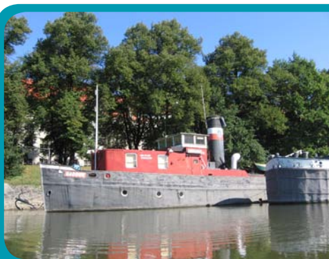
16. The NADBÓR ship

By the Wyspiański Coast in the tavern, there is the rowing section famous for training many European and World champions as well as Olympians. Not far away there is the Students' Sport Association Yacht Club.