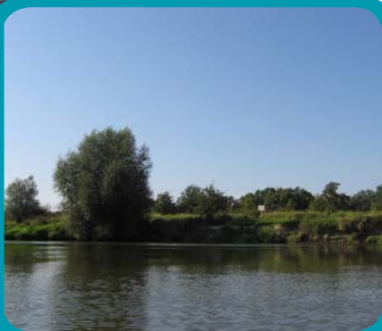
10. The Biskupin estate from the Oder River