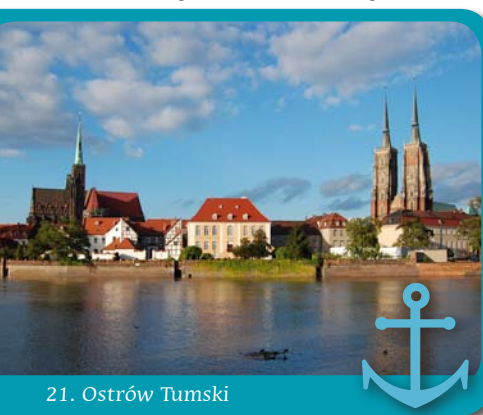
21. Ostrów Tumski

Sailing out behind the Peace Bridge into the Ostrów Tumski area, behind St. Joseph Street we can see a scenic hill, located against the background of the Wrocław Cathedral, which water sports enthusiasts call the Oder Enthusiasts' Hill. Not far from there we can find the buildings and beautiful gardens of the Papal Theological Faculty.