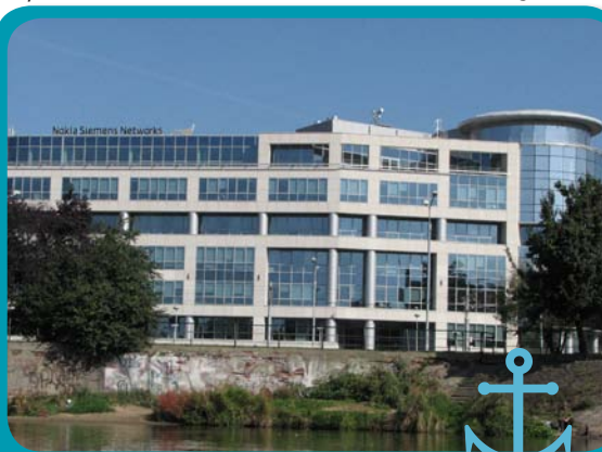
Mooring place near Bema Square

10.9 km - Heading right, we sail under the historic Tumski Bridge decked with newlyweds' padlocks and we sail to the new, three-storey restaurant "Barka Tumska" (The Tumski Barge) floating on the water. Here we can refresh ourselves and quench our thirst. In order to walk on the city islands and Ostrów Tumski streets (starting from the Holy Mary