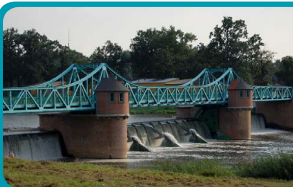
9. The Bartoszowice Weir

9 The Weir and the lock, that is, the Bartoszowice barrage: These are important water buildings acting as a weir. They regulate the water level before Wroclaw, and they open the Navigation and the Flood Canals. The width of three spans of the lock is 100 m. The length of the lock's chamber is 188 m, the width 9.6 m, the water slope over 3 m. Buildings were built in 1917 and some of them, e.g. needle weir winch, are engineering monuments.